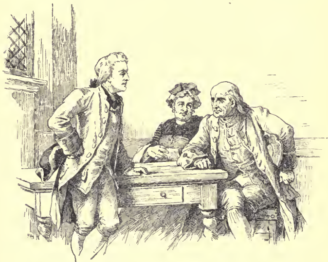
'Private negotiation with the parents.'